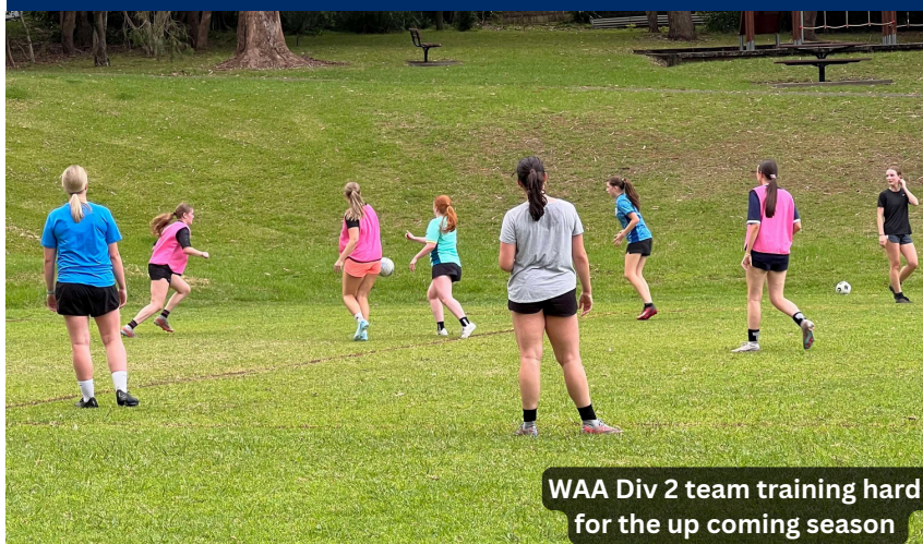
WAA Div 2 team training hard for the up coming season