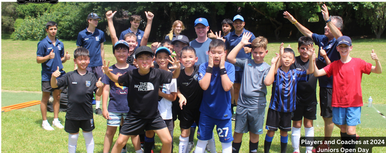
Players and Coaches at 2024 Juniors Open Day